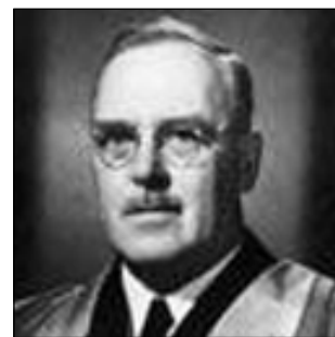
Figure 8. Dr Ernest Marsden,* first Patron of NZAS.

important projects, such as the technicians’ survey, the scientists’ survey, and preparation of a new edition of the Directory of New Zealand Science . The New Zealand Science Review had continued to publish reviews of science topics, abstracts of New Zealand research papers, and information on the Association’s affairs and science policy matters.