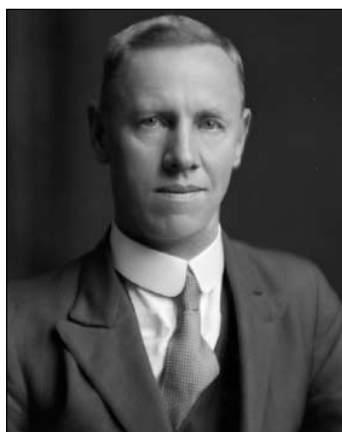
Figure 2. Dr Walter Oliver,* first Patron of NZAScW.

On 8 April 1942, there was a screening of scientific and educational films, again designed to enlighten non-scientists and held at the Dominion Museum, admission sixpence; the topics included: Vitamins; Telephones; Airscrews; Raw materials [31]. The Association decided to form a review panel for scientific educational films and even formulated a scheme for making such films in New Zealand [§ 26/11/1943]. Later, when two Australian Government films on aboriginal life, 'Tjurunga' and 'Walkabout', had been banned by the New Zealand censor, the review panel made representations to have that decision reviewed [§ 31/08/1946] and succeeded in having it overturned [32].